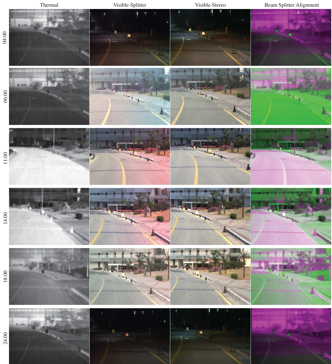
Fig. 3 These figure are dataset examples captured from the same location during a day.